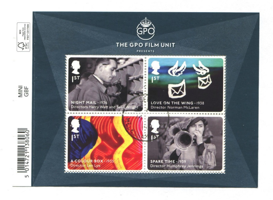
Miniature sheet with a TPO stamp from the film "Night Mail"

One of the 1st Class stamps included in that miniature sheet was the 1936 film "Night Mail" that depicted one of the scenes from that film. It showed a Post Office employee sorting mail on a Travelling Post Office.